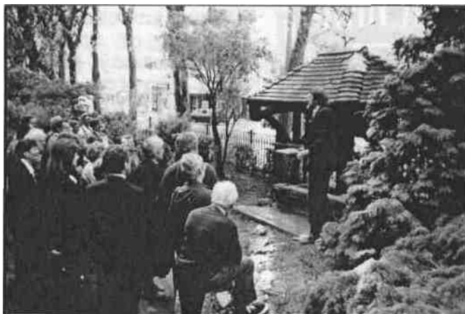
Contemplating Crime and Punishment in Tudor Hackney beside the whipping post in the church yard