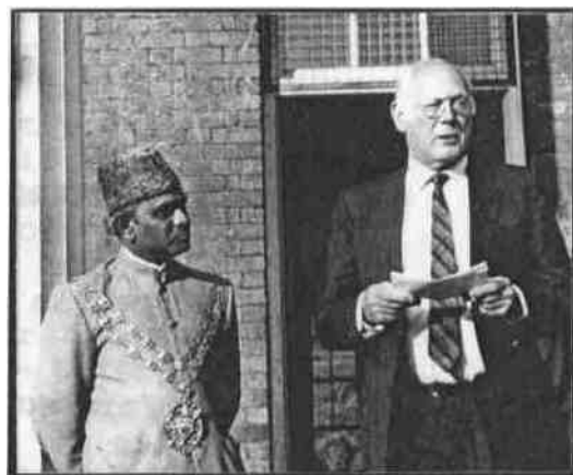
Lord Montagu with Mayor Shuja Shaikh at the launch of the "Save Historic Hackney" Exhibition.

This public exhibition, organised by English Heritage in conjunction with The Hackney Society, The National Trust and the Heritage of London Trust, attracted over 1500 people during the two weeks it was on display in Clissold House, Stoke Newington. The exhibition was organised in the wake of an English Heritage survey showing over 100 historic buildings at risk in Hackney.