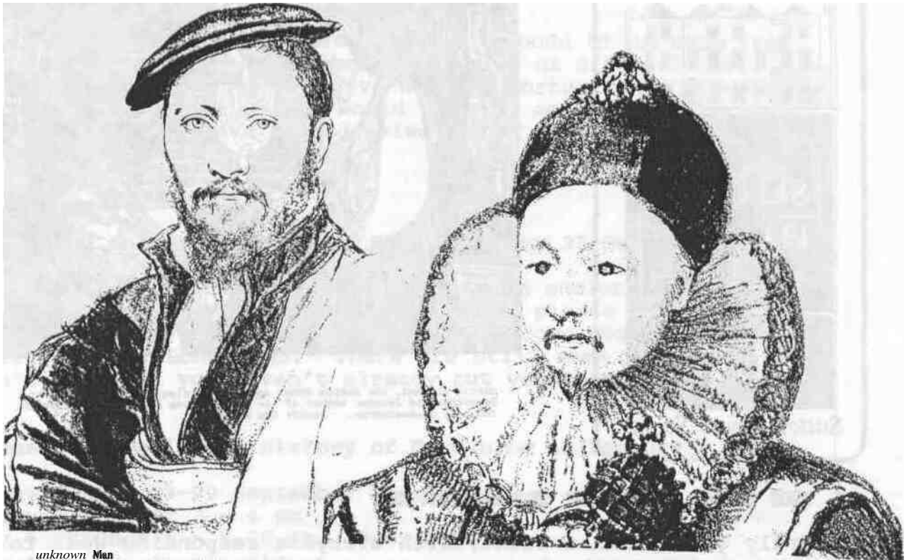
unknown Man Hindtor Cattle, Royal Library

Hans Holbein, the younger, one of the greatest portrait painters of all time, drew or painted many of the key people associated with the Tudor Court of Henry VIII, but he never painted Sir Ralph Sadleir - or did he?