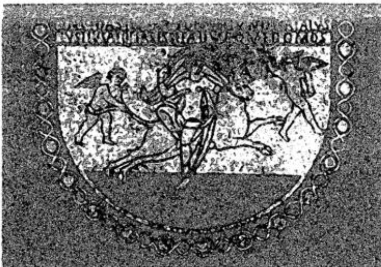
Jupiter in the guise of a bull is seen abducting Europa.

Spring is in the air and the Society is responding by planning its programme of activities for this year. Our major summer excursion is to Knole House (National Trust) in Kent on Saturday 6 th July when members are invited to partake of a picnic in the famous deer park. The outing will also include a visit to the nearby Roman Villa at Lullingstone (English Heritage). The Roman Villa lies close to the River Darent. It is one of seven Roman Villas known in the Darent Valley and dates from the first century A.D. but was largely rebuilt in the fourth century with beautiful mosaic floors and wall paintings some with Christian iconography. It was discovered in 1939 having been preserved by land slippage from the hill behind over several centuries.